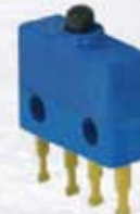
MS27257-X (8805/76) OTTO B3 Series (0.200" Width)