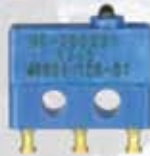
M8805/106-XX OTTO B2 Series (0.200" Width)