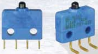
M8805/101-XXX OTTO B3 Series (0.156" Width)