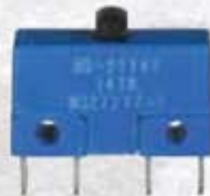
MS27217-X (8805/7) OTTO B5 Series