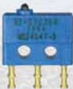
MS24547-X (8805/4) OTTO B2 Series (0.200" Width)