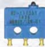
M8805/109-XX OTTO B2 Series (0.156" Width)