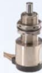
MS24331-1 OTTO P6 Series