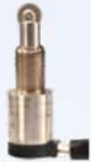
MS27240-X OTTO P6 Series