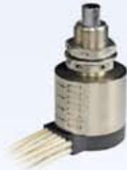
MS21321-X OTTO P6 Series